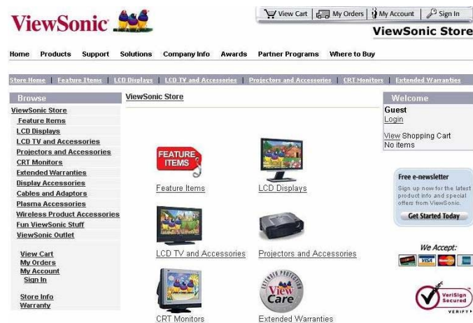
Figure 2: Robust order capture and back-end integration lower sales costs from order

iStore supports online ordering of products and services for the Telecommunication industry. Unlike basic “web stores”, iStore’s advanced cart features enable an interactive, intuitive sales process, allowing customers to seek live sales assistance, apply promotion codes, or perform availability checks during their visit. Cross-sell and up-sell opportunities are created dynamically on a compelling and easy-to-use user-interface. Checkout processes are short and efficient, reducing cart abandonment. For example the B2C checkout can be completed on a single page. You can also allow users to specify the ‘end-customer’ thereby enabling drop-shipment execution.