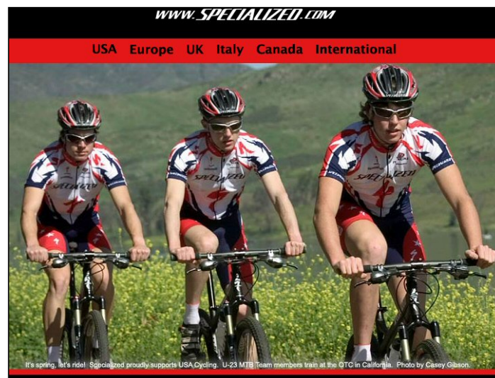
Figure 3: Create specialty stores for different customer segments

Different types of customers have different needs. With Oracle iStore, you can create many stores, including ones for particular B2B customers and partners. Each store can have its own "personalized" product selection, UI and process flows—while all stores leverage a unified central repository for products, content, and merchant administration.